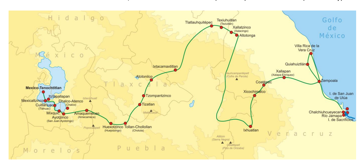
Illustration 2. 'La Ruta Cortés' overland, between San Juan de Ulúa (Veracruz) and Tenochtitlan (Mexico City)